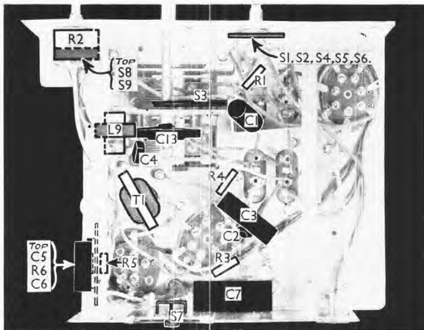
Under-chassis view. C13 is a compression-type variable capacitor. A diagram of the waveband switch is inset in the circuit diagram overleaf.

LW. —Switch set to LW, tune to 1,090 m on scale, feed in a 1,090 m (275 kc/s) signal, and adjust C12 and C9 for maximum output, resetting the reaction to a point just short of oscillation.